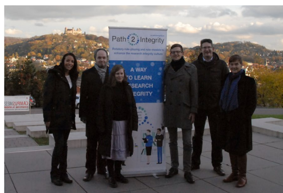
Symposium on scientific practice, Coburg, 11 and 12 November 2019