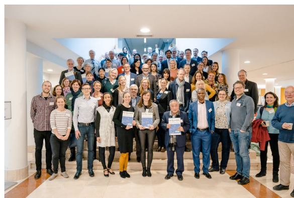
Mini-conference, Brussels, 30 October 2019 © graphic recording Holly McKelvey, holly-draws.com