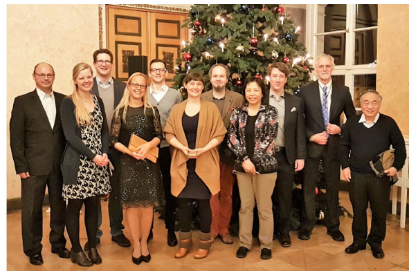
Kick-off meeting, Coburg, 10 and 11 January 2019